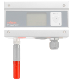
HF5 transmitter with protection-filter cap (red)