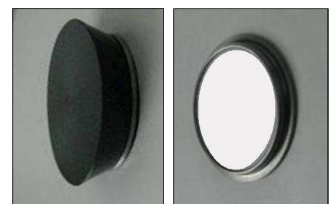
Mounted HC2-IT25 probe Left : with protection cap