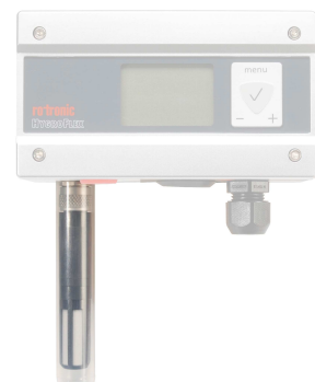
HF5 transmitter with protection-HC2 (transparent)